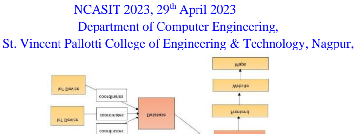
Figure 3. System Architecture.