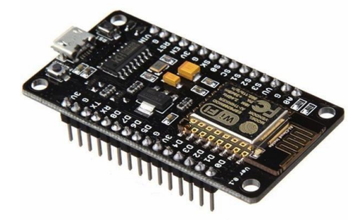
Figure 1. ESP8266 NodeMCU.

3.3 volts. It contains two buttons - reset and flash. The reset button resets the NodeMCU and the flash button is used to enable GPIO0 (for General Purpose Input and Output pin 0) which takes input from data pins. The board has 4 power pins (one pin VIN for input power and three pins for 3.3 volts output power supply) and 3 GND pins for ground supply (or used to connect negative terminals).