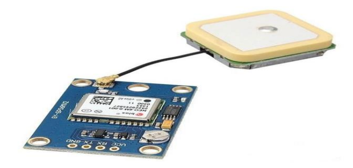
Figure 2. GPS Module (NEO-6M)

GPS module is generally used to get the location coordinates, where the device is placed. It is ahighperformance and strong satellite connectioncapability GPS receiver with an antenna connected to it. It has an in-built EEPROM to store the data parameters. It has power and signal indicators with a backup battery for data storage. It requires a power supply of 3.3 volts to 5 volts. The board contains 4 pins - VCC, GND, TX, and RX. VCC pin provides the power supply to the module. GND pin is forground supply (and connection of negative terminals).TX pin is used to transmit the data from the GPS board to the RX pin of NodeMCU. RX pin is used to receive the data from the NodeMCU connected to theTX pin of NodeMCU.